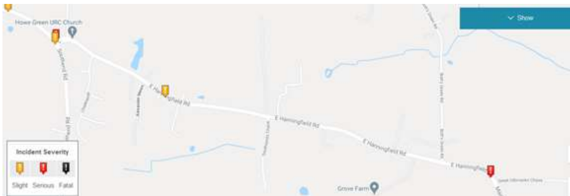
Map 21 showing crash map data, serious incidents, E Hanningfield Road/Southend Road, 6/7/2017 and at E Hanningfield Road/Gibcracks Chase junction, 6/1/2020.