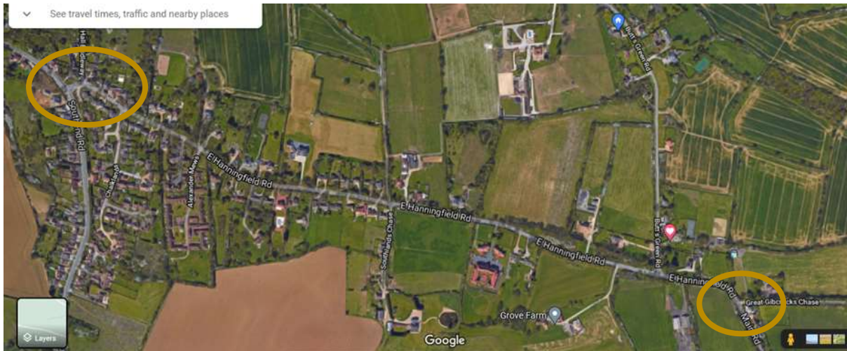
Map 20 showing junctions of concern at East Hanningfield Road/Southend Road at Howe Green (left) and East Hanningfield Road/Gibcracks Chase