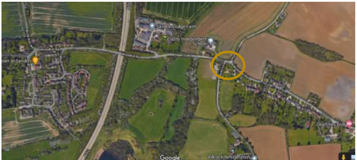
Map 18 showing junction of concern at Woodhill Road/Hulls Lane/Mayes Lane